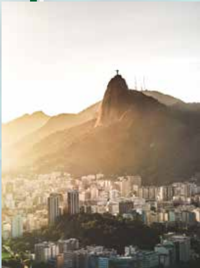
Rio de Janeiro